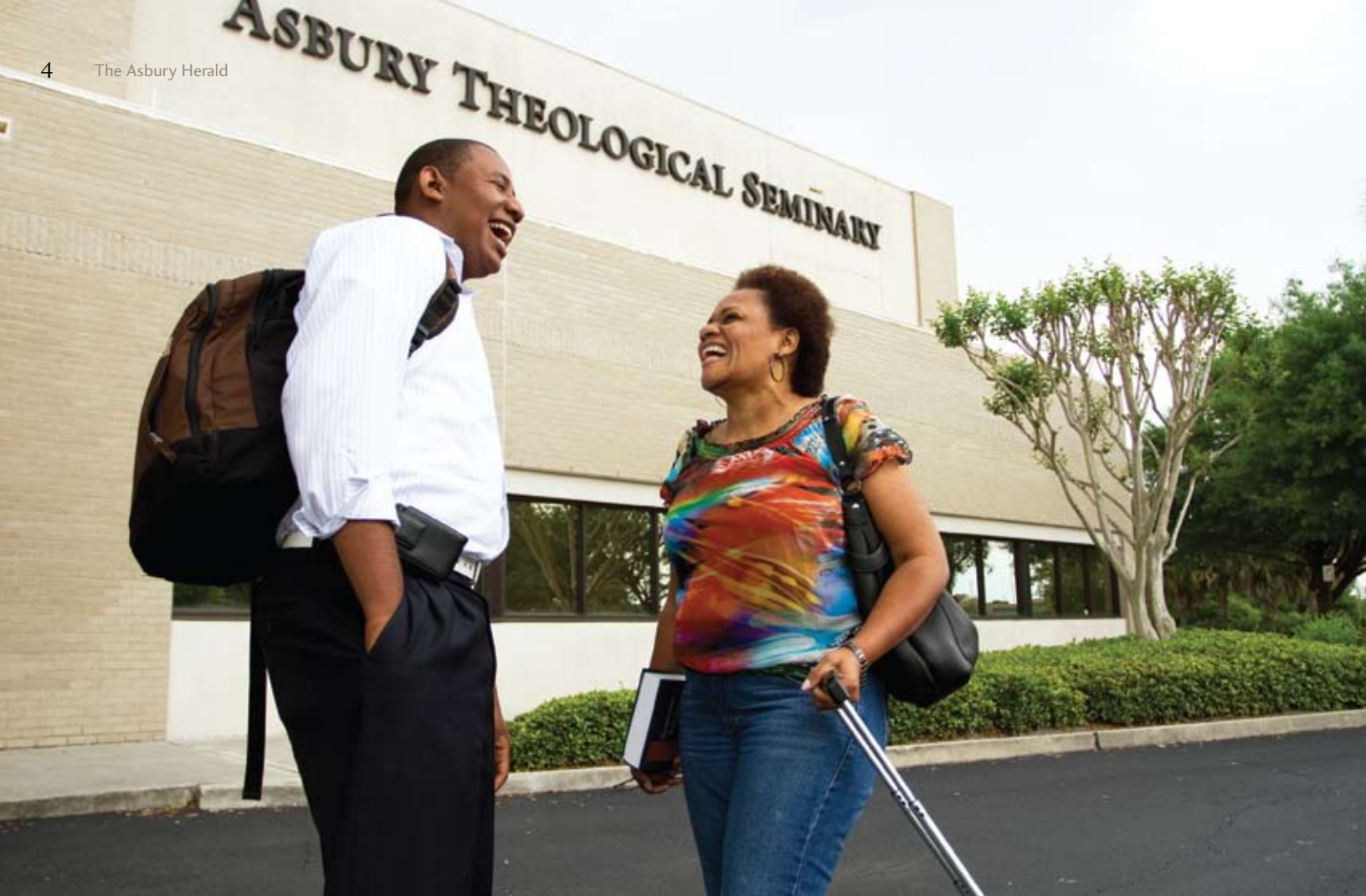
ABOVE: Classmates laugh outside the Florida Dunnam campus building after their afternoon class.